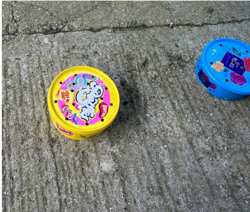
Sweet tubs with holes in lid. I usually put a brick in to give them some stability.