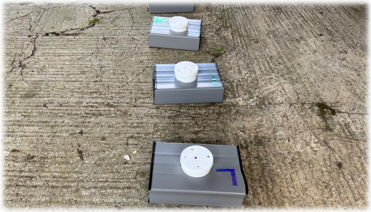
Plastic tubs in a console

2 distraction odours from either groups level 1, 2, 3, or 4 will be used.