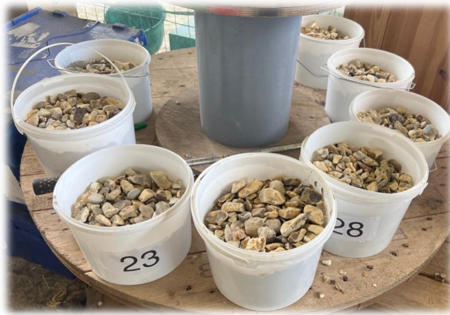
Buckets with gravel – not in game set up.